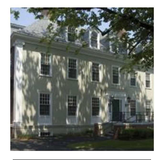
710 Soldiers Field Road Boston, MA 02163