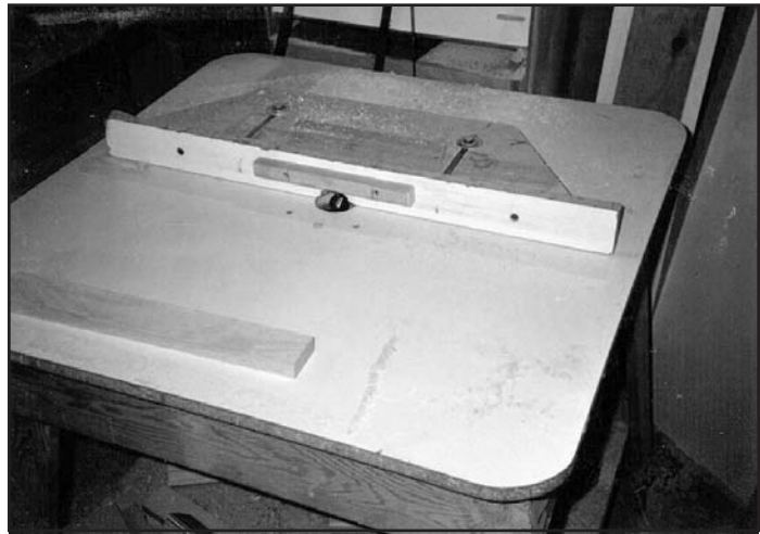
Exposed cutting head on shaper.

Hazardous kickbacks of the stock also can occur.