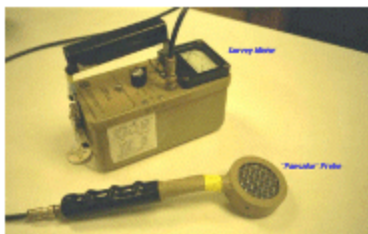
General Purpose Survey Meter with GM Probe

The Geiger-Mueller (GM) probe is the most common radiation detection instrument on campus. In this meter, radiation detection causes both visual and audio responses. The meter detects radiation events and does not differentiate types of energies or radiation. The GM is only used to detect radiation and does not measure radiation dose. The most common GM is a Pancake Probe, as shown below with a survey meter.