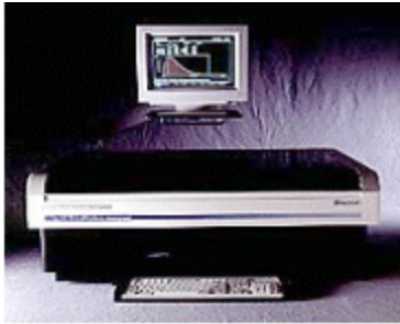
Liquid Scintillation Counter

Scintillation detectors absorb radiation and emit light that is converted into a radiation measurement. There are two types of scintillation detectors a solid hand-held instrument and a liquid counting system.