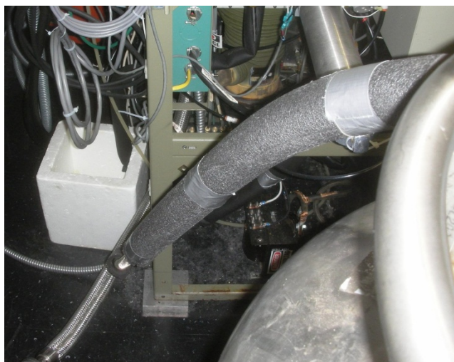
Figure 7 Container for LN2 overflow when filling cold trap. What happens if this becomes blocked?