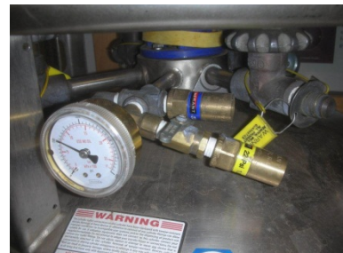
Figure 4 Cylinder with high and low pressure relief setup for high pressure use (valve to low-pressure valve is closed).