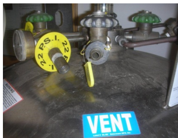
Figure 3 Cylinder setup for low pressure only. Note outlet restraints on vent valve.