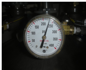
Figure 2 Pressure gauge on high pressure setup.