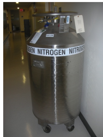
Figure 1 Typical liquid cylinder