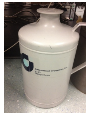
Figure 5 Dewar