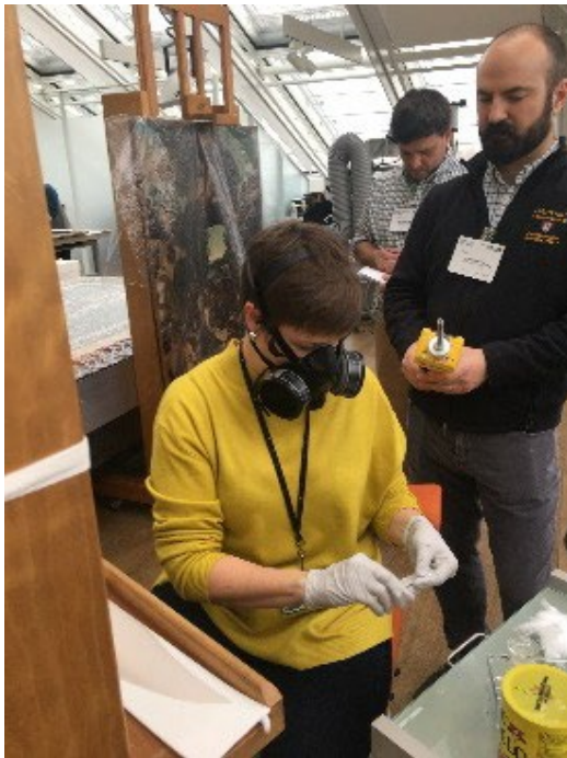
Left: Monitoring VOCs in art conservation space.