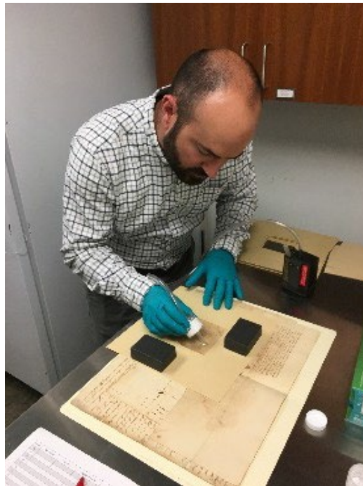
Right: sampling of unusual materials in manuscripts.

Contact your EH&S DSO or LSA to schedule a site visit and to learn more about resources available to your conservation lab. E-mail: ehs@harvard.edu Phone: 617-432-1720 Website: http://www.ehs.harvard.edu