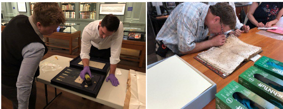
Left: Measuring radiation from a collection of scientific instruments, samples and manuscripts. Right: Inspecting library special collection impacted by pest damage.