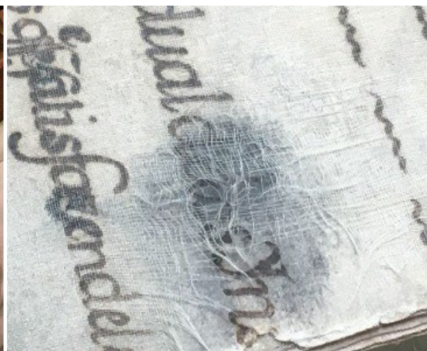
Right: Historic restoration technique involving arsenic-containing adhesive and silk mesh on library special collections.

Collections that are known or suspected to be impacted by mold, pesticides, pests or their droppings, chemicals, metals, radioactive elements or poisons or are just unusual should be handled (if they must) under the assumption they are impacted and following Universal Precautions.