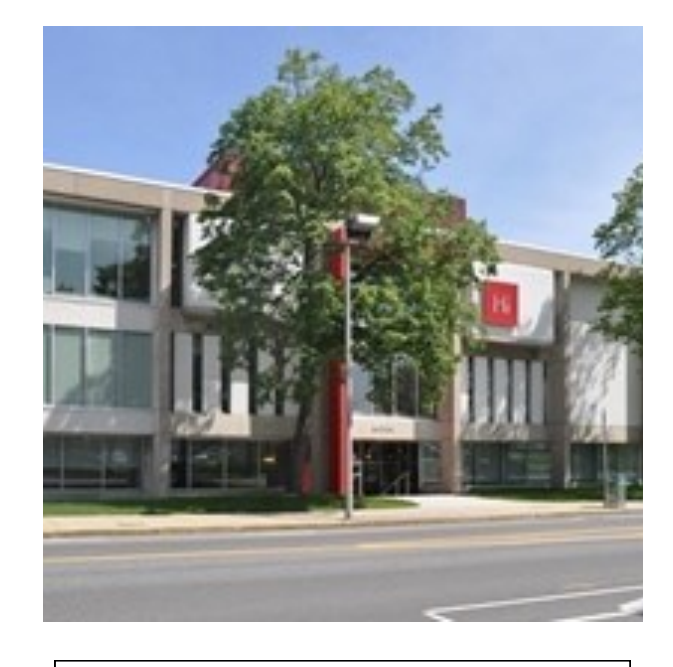
125 Western Ave Boston, MA 02163