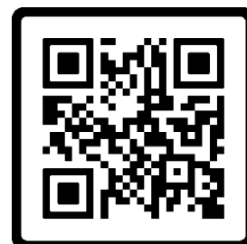
Lab Safety Guideline